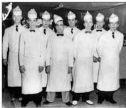
Casio's Restaurant, Locust around 1956 Can You Name Any Of These Fellows?