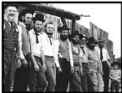
Locust Centennial 1969